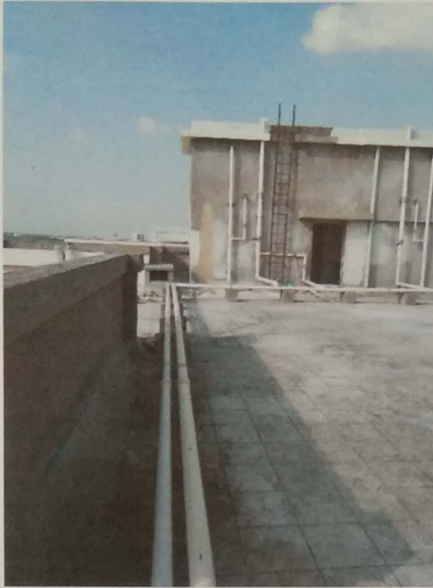
OVERHEAD WATER TANK & PIPE RING