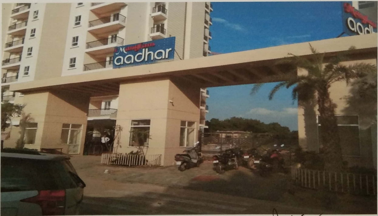
REAR SIDE PHOTOS

Rishi Ar. Rishikesh Jalendra A-546 Manglam grand city Ajmer road Mahapura Jaipur CA/2013/58944 CTP/RAJ./Architect/2021/75