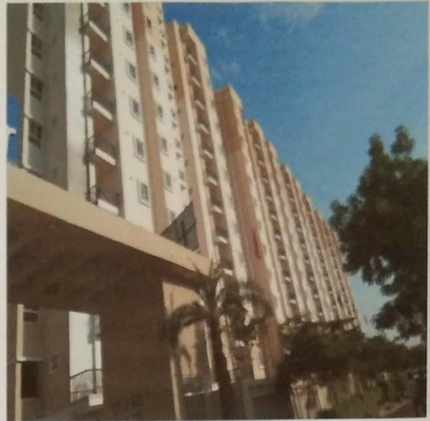
REAR SIDE PHOTOS