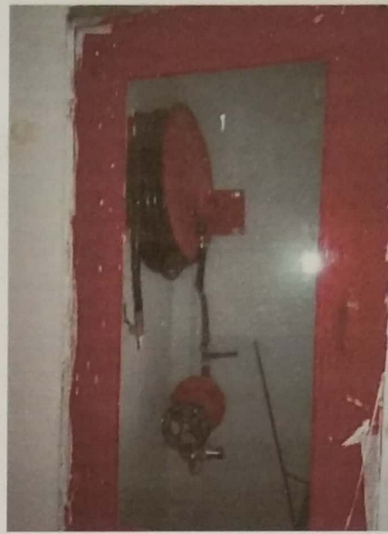
FIRE HYDRANT & HOSE REEL