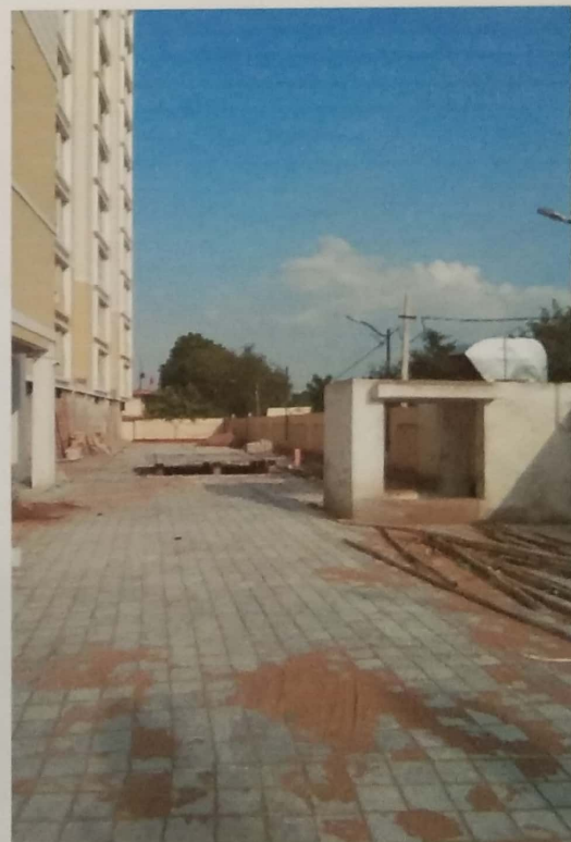
STP IN SITE SETBACK

Rishi Ar. Rishikesh Jalendra A-546 Manglam grand city Ajmer road Mahapura Jaipur CA/2013/58944 CTP/RAJ./Architect/2004/175