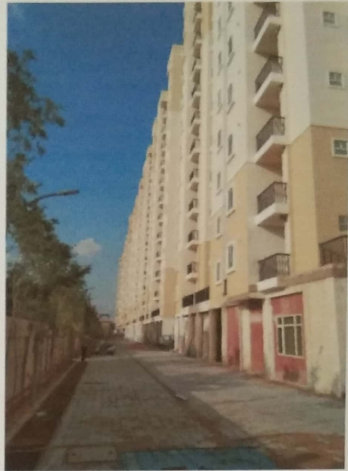
REAR SIDE SETBACK