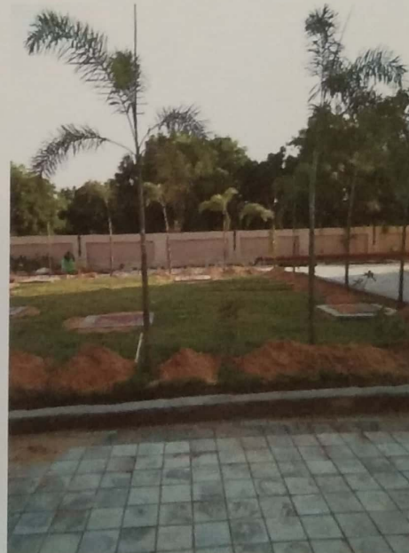
GREEN AREA PHOTOS

Rishi Ar. Rishikesh Jalendra A-546 Manglam grand city Ajmer road Mahapura Jaipur CA/2013/58944 CTP/RAJ./Architect/2021/75