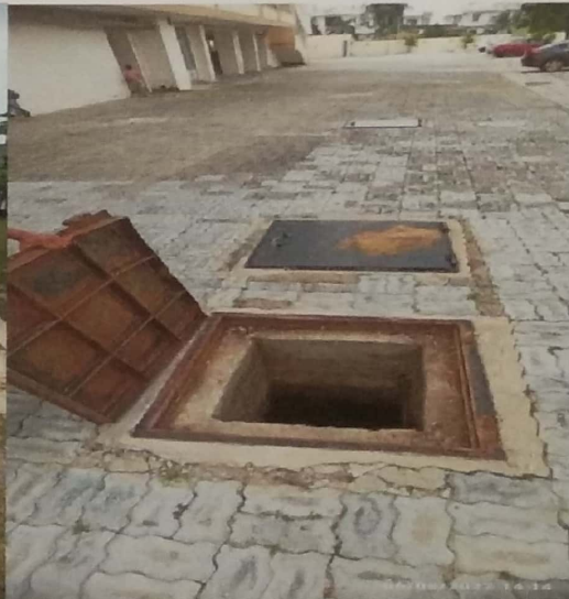
WATER & FIRE TANK