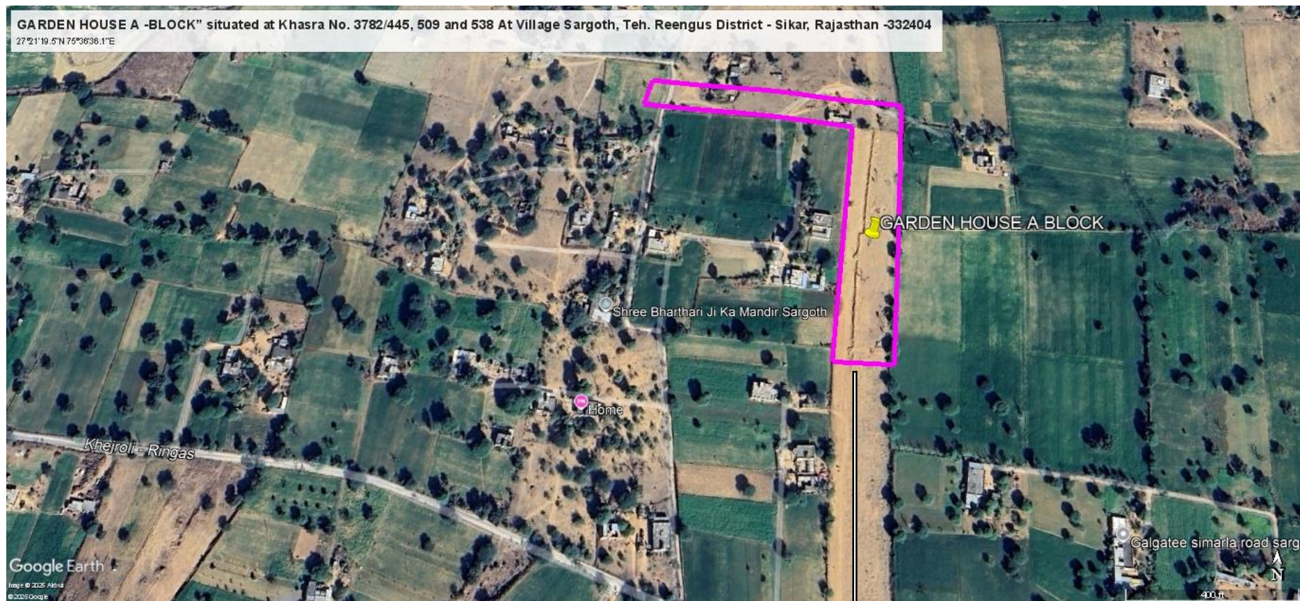
GARDEN HOUSE A -BLOCK" situated at Khasra No. 3782/445, 509 and 538, At Village Sargoth, Teh. Reengus District - Sikar, Rajasthan -332404